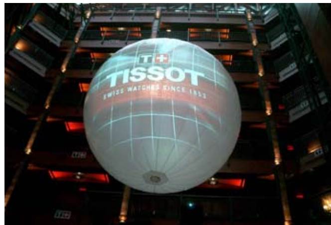
Tissot's logo and tagline were projected onto a 20 foot balloon to create an amazing first impression of the event.

A Barco HD projector with specialty lens was used to project images onto the balloon from a distant balcony, creating crisp and vivid graphics that were clearly legible throughout the vast space.