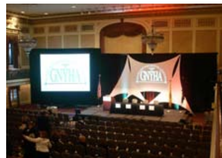
Greater New York Hospital Week