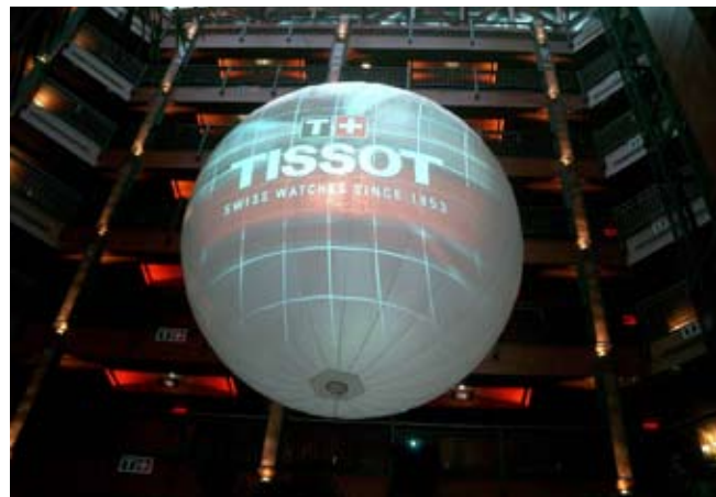
Tissot's logo and tagline were projected onto a 20 foot balloon to create an amazing first impression of the event.

Eight 50" plasma screens were placed around the perimeter of the lobby area and showed vibrant, colorful images of the products. Multiple large screens were strategically placed flanking the balconies to maximize the view of the product presentations, while live audio and video feeds were carried simultaneously to multiple break-out rooms throughout the hotel.