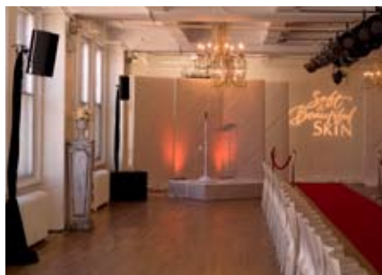
Beautiful Skin Runway Show & Makeup Demo for K.I.M Media

AV Workshop has provided audio visual services for many event producers, including: