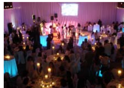
Private Celebrity Cocktail Party