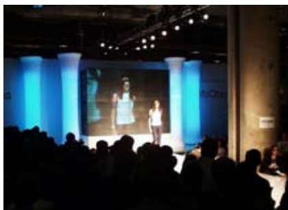
Fashion Show for WE Media